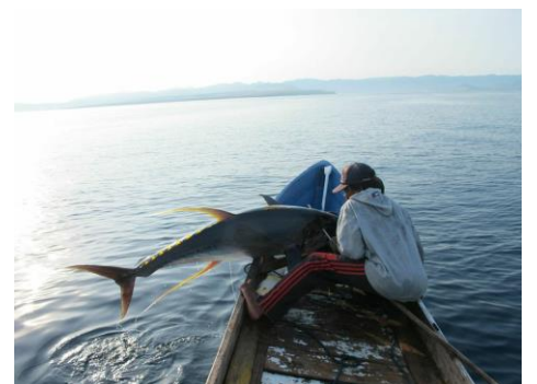
Handline fishing for yellowfin tuna: FIP training in Indonesia