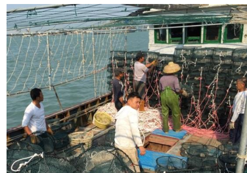
MSC pre-assessment in China