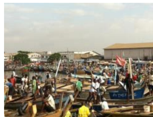
Institutional strengthening for improved fisheries management in Ghana

If you would like to know more about us or discuss how Poseidon can assist with your work, please get in touch or visit www.consult-poseidon.com