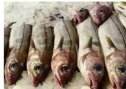
Assessing the discard ban in UK fisheries

Through consultancy services we assist the fisheries sector to realise its potential in terms of maximizing positive economic, social and environmental impacts. We will shortly conclude a project for Pew Charitable Trusts to map tuna product flows and estimate an annual global market value of tuna trade . In the Pacific region we currently have a number of long-term commitments to: support PNA countries in economic modelling of tuna fleets to inform the setting of access fees; provide technical input and capacity building support to the offshore fisheries sector in the Solomon Islands, Marshall Islands and PNG ; and provide technical advice to FFA countries in responding to EU IUU