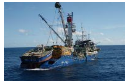
Advice to Solomon Islands on offshore fishing