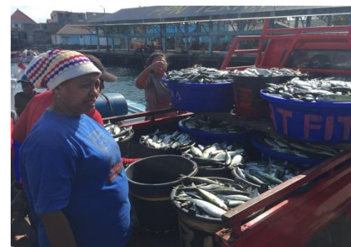
Indonesia community fisheries project